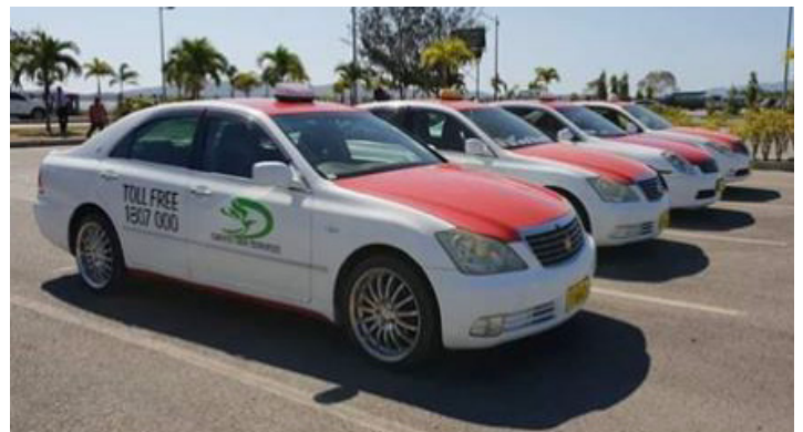
Picture Caption: Passengers can now make payment using bank cards on Safeco Taxi

Interested taxi operators and businesses are welcome to enquire on how to have a wireless terminal in their taxis by sending an email to ebanking@ncsl.com.pg or call 313 2069/67.